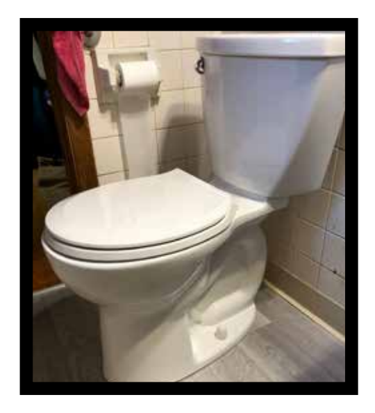
"I'm so glad y'all came to help me out, I didn't know what else to do. You're a life saver"