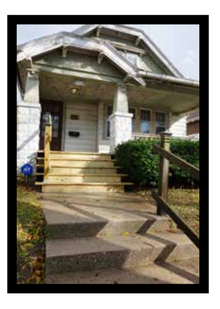
"Before [Revitalize Milwaukee] came to fix my porch I was worried someone was going to fall through it."