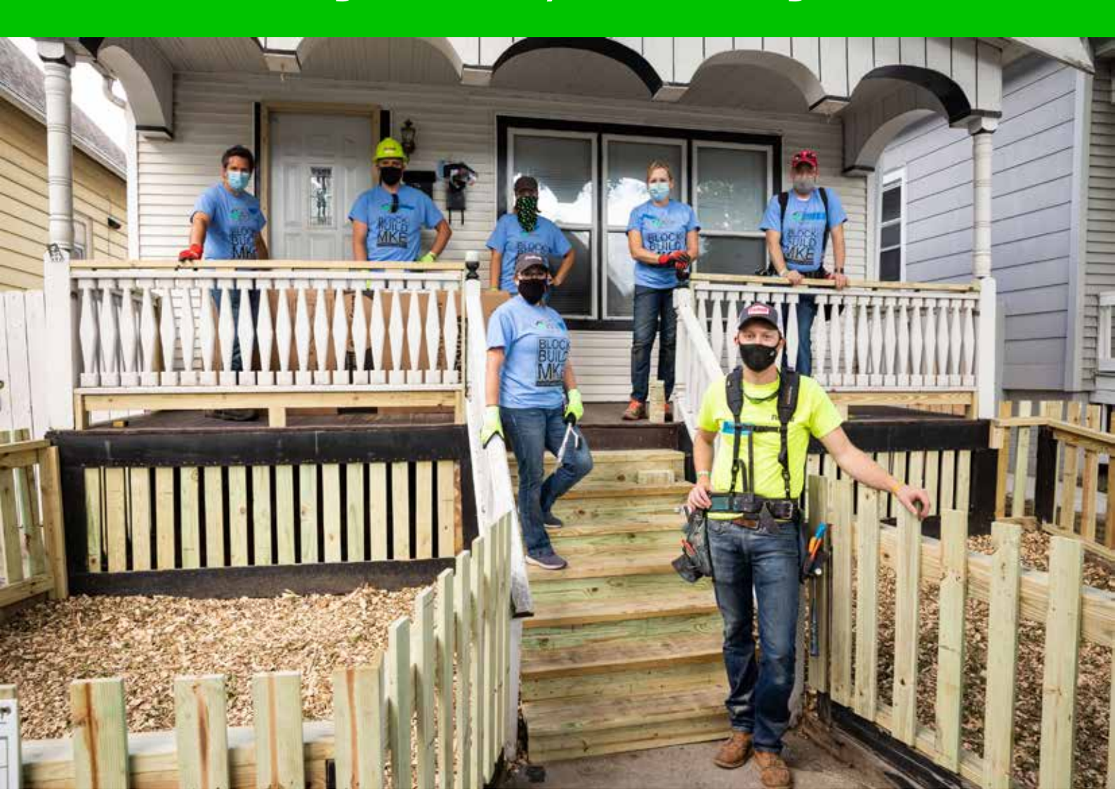
2020 Block Build Home Sponsor: Findorff